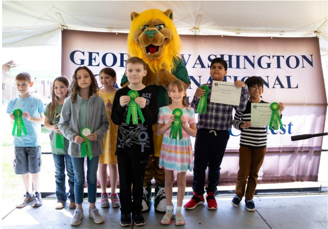
Roary the Lion and honorable mention winners at George Washington Carver 2022